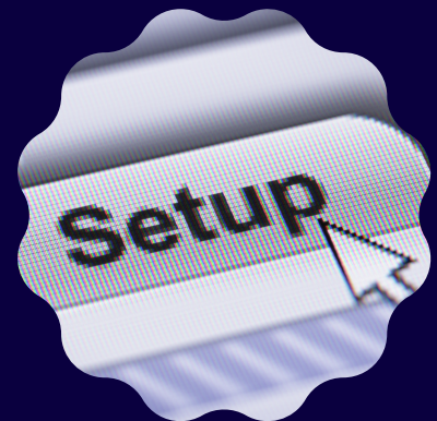
Social Media Setup Tips